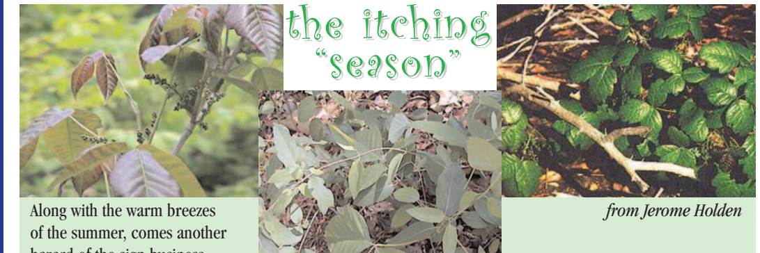
from Jerome Holden

$47/pp Reserve your tickets now! ricks@signsnh.com or call: 868-9200